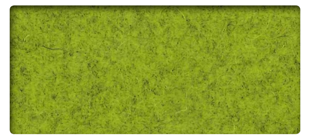
Avocado Green (AV)