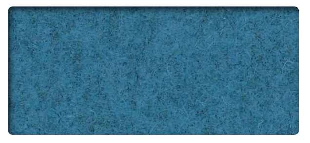
Ice Blue (IC)