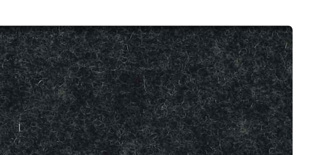
Charcoal Grey (CL)