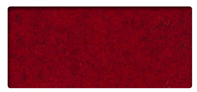
Chilli Red (CR)