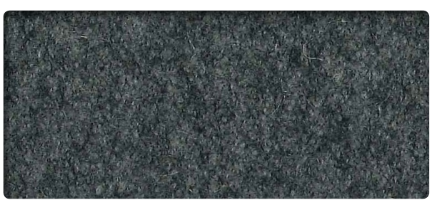
Stone Grey (ST)