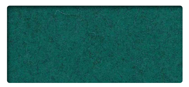
Emerald Green (EM)