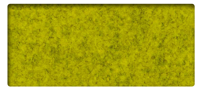
Bumblebee Yellow (BB)