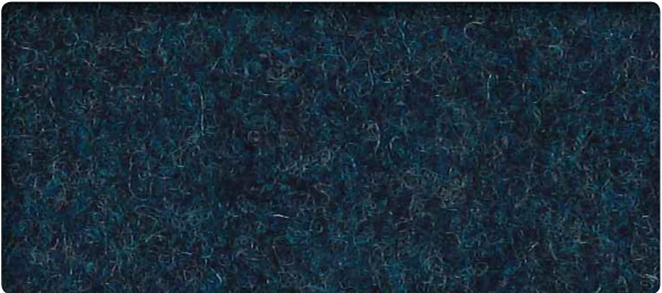
Deep Blue (DB)