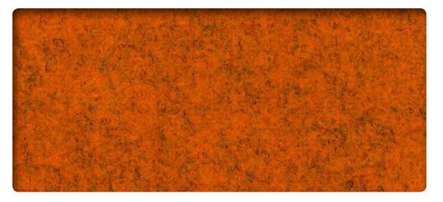
Sunset Orange (SO)